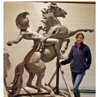
Bellerophon astride Pegasus

Amy will be busy working on a show jumper, 'Alvin', by the open Weekend, and will also have newly-cast editions of 'Treo' available.