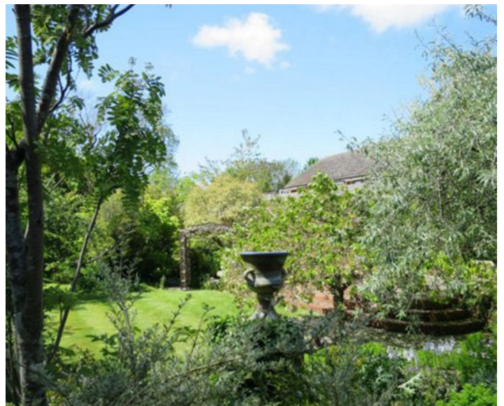
The Garden at Project Workshops

Her work will be on display in the Life Studio at the Summer Show along with invited visiting artists, print makers, photographers and jewellers.