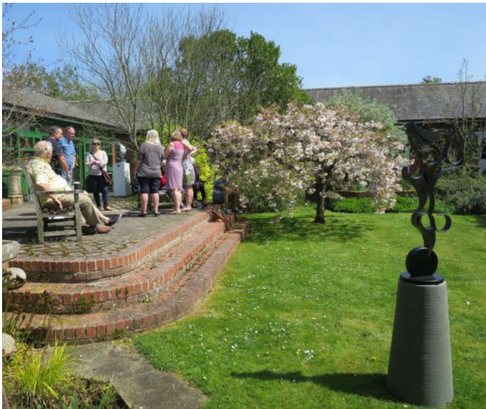
The Garden Courtyard at Project Workshops

It's the weekend of May 13th and 14th, and you're in front of the telly, and wondering whether you should mow the lawn - and then a voice breaks the silence, "Right, up you get. Off to the Project Workshops Summer Exhibition".