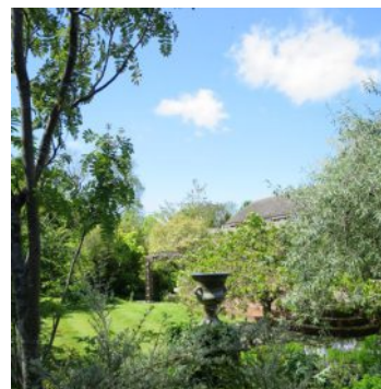
The Garden at Project Workshops

If you are interested in any of these classes or would like to hire the Life Studio for workshops, meetings or classes you can contact Mandy on 01234 889889 for further details.