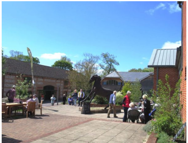
The Courtyard at Project Workshops

With free entry, refreshments available, facilities for the disabled and plenty of parking it's a great day out for all the family. There is something to interest everyone and we look forward to welcoming you.