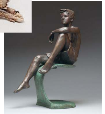
Vivi Mallock - Sculptor