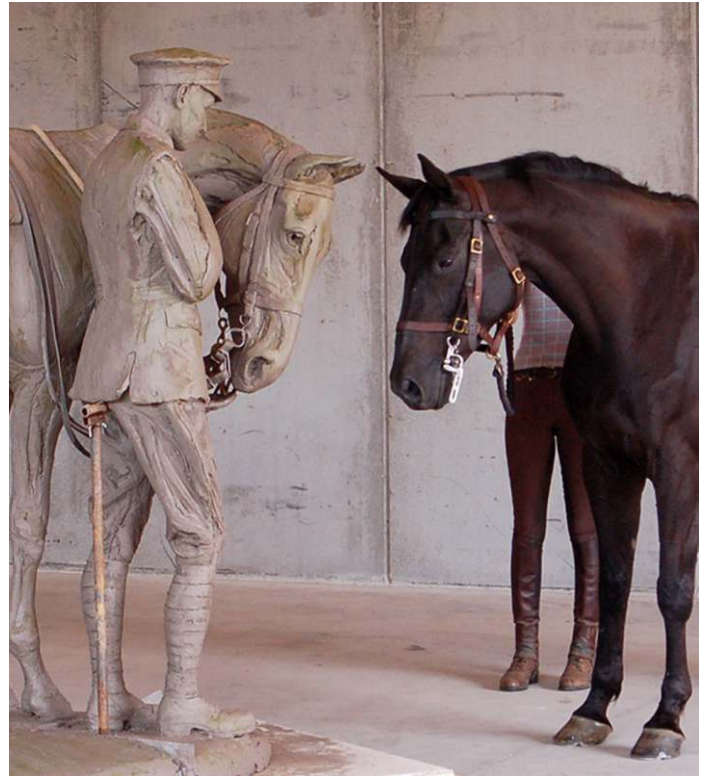
Beautiful 'Chips' meeting the War Horse sculpture