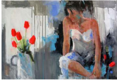
Soraya French - Artist