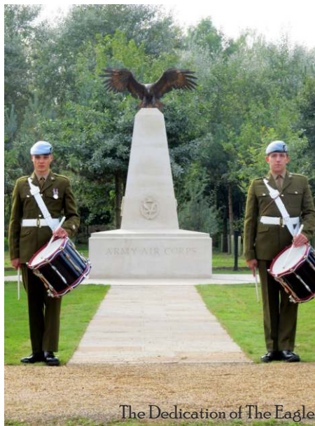
The Dedication of The Eagle

Ongoing work includes two portrait busts of British officers who took part in the D Day landings, for installation in Normandy on the 70th anniversary of the Landings in June next year, bringing her total number of bronzes in Normandy to eight.