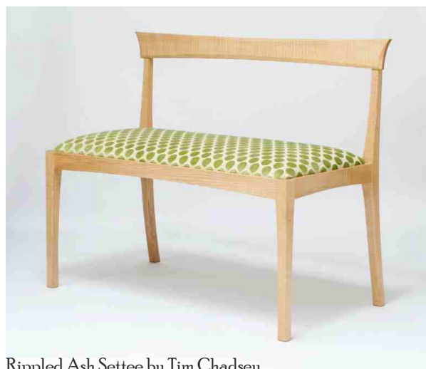
Rippled Ash Settee by Tim Chadsey

10th November: The National Glass Fair at The National Motorcycle Museum, Solihull