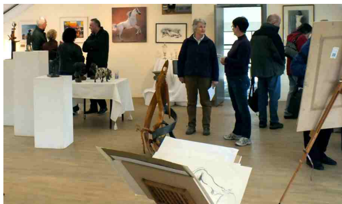
The display in the Life Studio