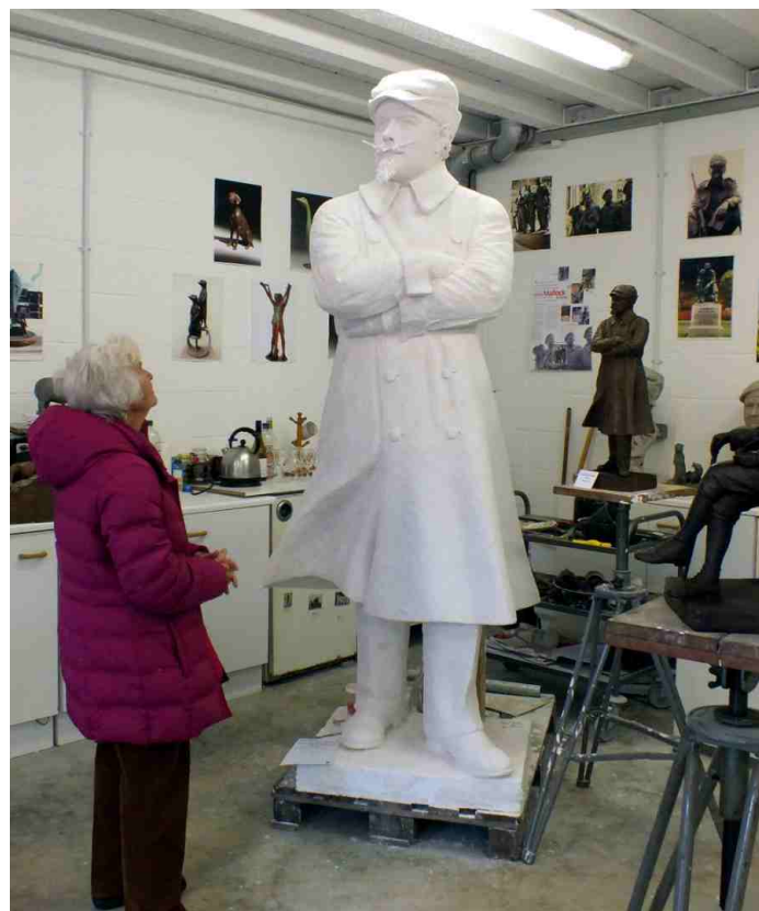
'Cody' by Vivi Mallock