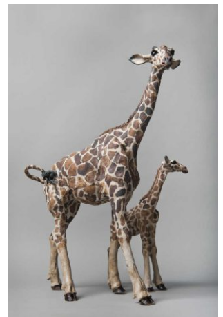
Giraffes by Elaine Peto

Many of the Project Workshops artists now offer lessons and demonstrations for groups, including pottery, glassblowing, stone carving and painting - a voucher for a day or weekend course can make an original and popular Christmas gift idea. Activities such as Yoga, Pilates, and Life Drawing in the new 'Life Studio' activity space can also be booked in advance.