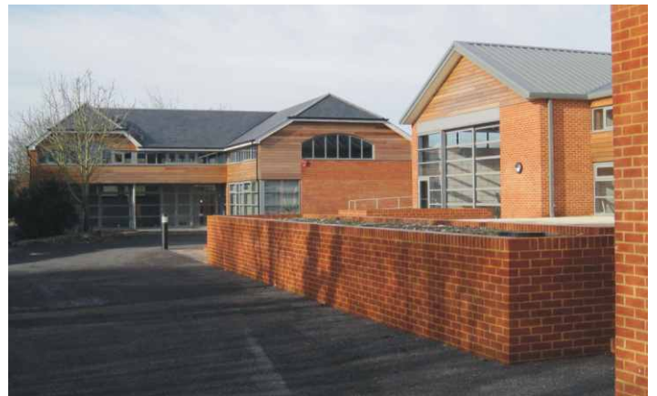
New Studios and Foundry

In aid of Alzheimer's Society and The Alzheimer's Research Trust