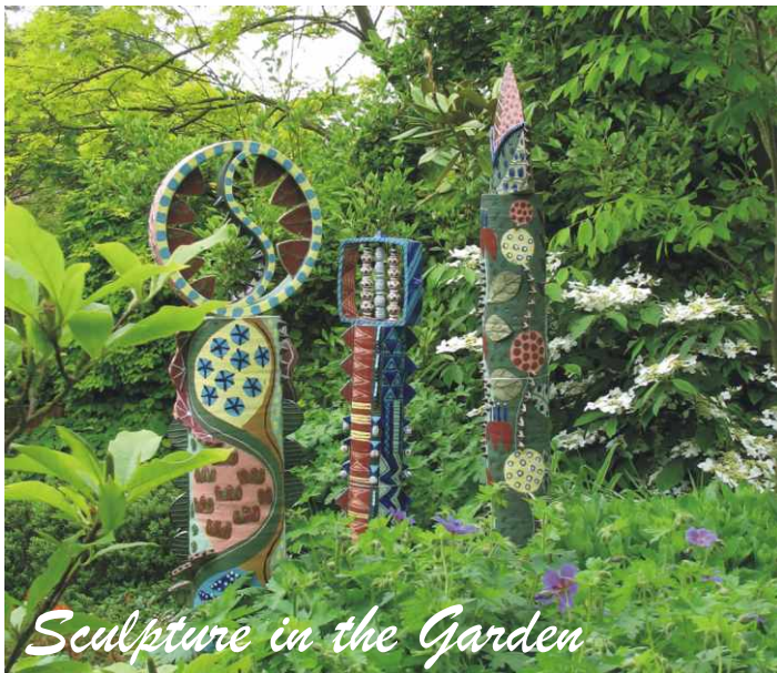
Sculpture in the Garden

SPRING IS HERE and there are surprises in store at Project Workshops for even our most loyal visitors: after three years hard work, our new buildings are ready and visitors to the Project Workshops Summer Exhibition 2010 will be the first to enjoy this hugely popular event in its spectacular new setting. Few who come to see for themselves the towering timber arches of the new gallery and browse through our biggest ever exhibition of work by visiting artists, will feel nostalgic for our trusty marquee; and few will be disappointed to find even more resident artists displaying a dazzling array of work in new, purpose-built studios. It's worth a visit just to see the buildings and the exhibition of sculpture in the new raised courtyard, but not everything has changed: the original Project Workshops is still home to its many brilliant resident artists, who will be opening their studios to visitors for this weekend and there is still the tranquility of the old courtyard garden for the horticulturally inclined.