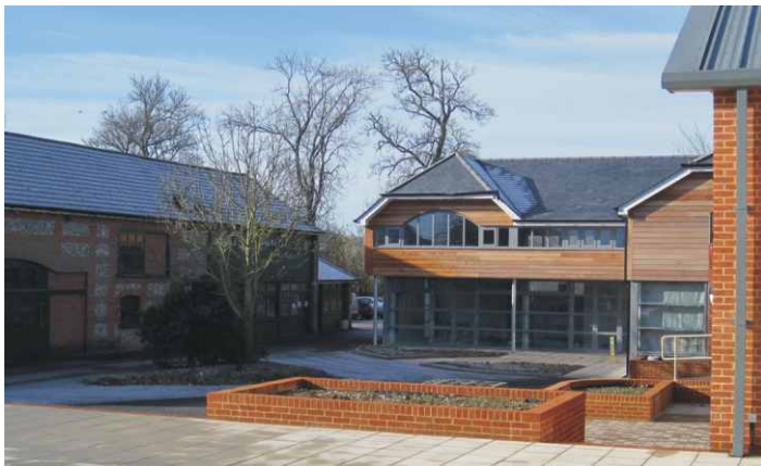
Project Workshops and Studios

Project Workshops is a vibrant centre for the visual arts in Quarley, near Andover, Hampshire. It is home to a dozen artists who create a unique range of sculpture, furniture, ceramics, pottery and glass vessels. Project Workshops has now expanded to include six fabulous new workshops, covered exhibition space and a brand new 4,000 sq ft sculpture foundry, one of the most modern and competitive in the country.